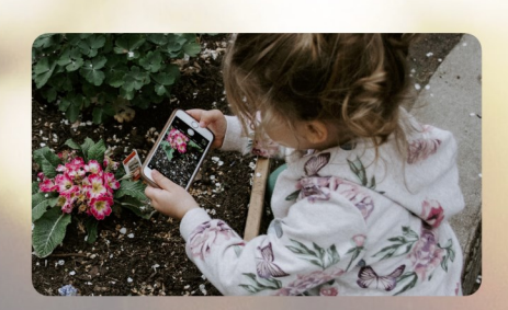
Wednesday, June 21 Celebrate Creation!

God's love is like a seed. Will we be good soil so we can grow and share that love with the world?